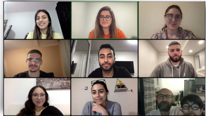
Young adults during a zoom meeting on February 28, 2023

We understand that these issues are multifaceted as young people are surrounded by competing worldviews and cultural forces aligning against the Christian faith. Therefore, our group is focused on prayers and facing as they seek the leading of the Holy Spirit.